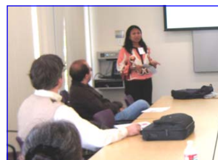
Annual Meeting of the NAAPAE Executive Council