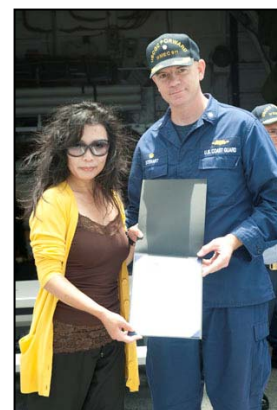
Above: A Member of the NLSC receives a Letter of Appreciation for her efforts on board a Coast Guard cutter off the coast of Africa.

For more information or to obtain an application, please visit www.nlscorps.org or call 1-888-SAY-NLSC (729-6572).